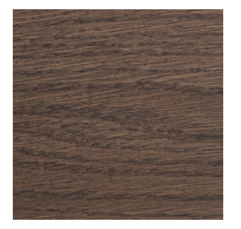
Walnut Stained Oak