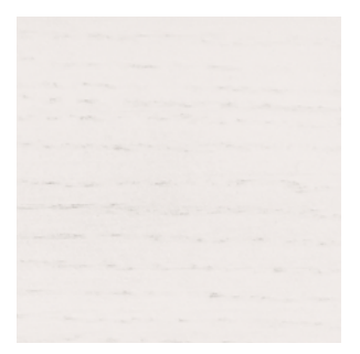
White Stained Oak