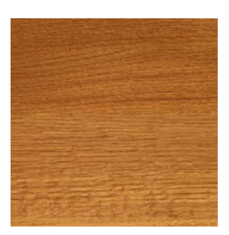
Orange 19 Oak Stain