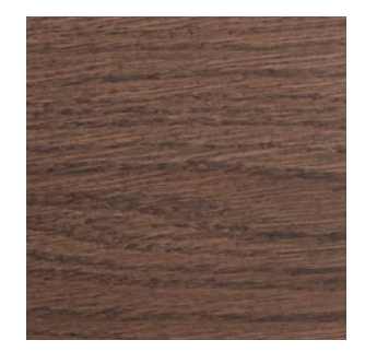
Walnut Stained Oak