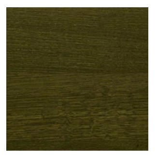
Green 21 Oak Stain