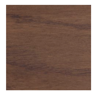
Ash Grey Oak