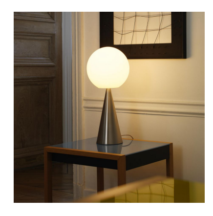
BILIA Table Lamp