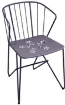
7100 - PERFORATED ARMCHAIR Laser-cut solid steel sheet seat Steel tube and rod base and backrest