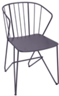
7101 - ARMCHAIR Solid steel sheet seat Steel tube and rod base and backrest