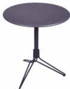
7110 - PEDESTAL TABLE Ø 67 CM Sheet steel table top Steel tube and rod base