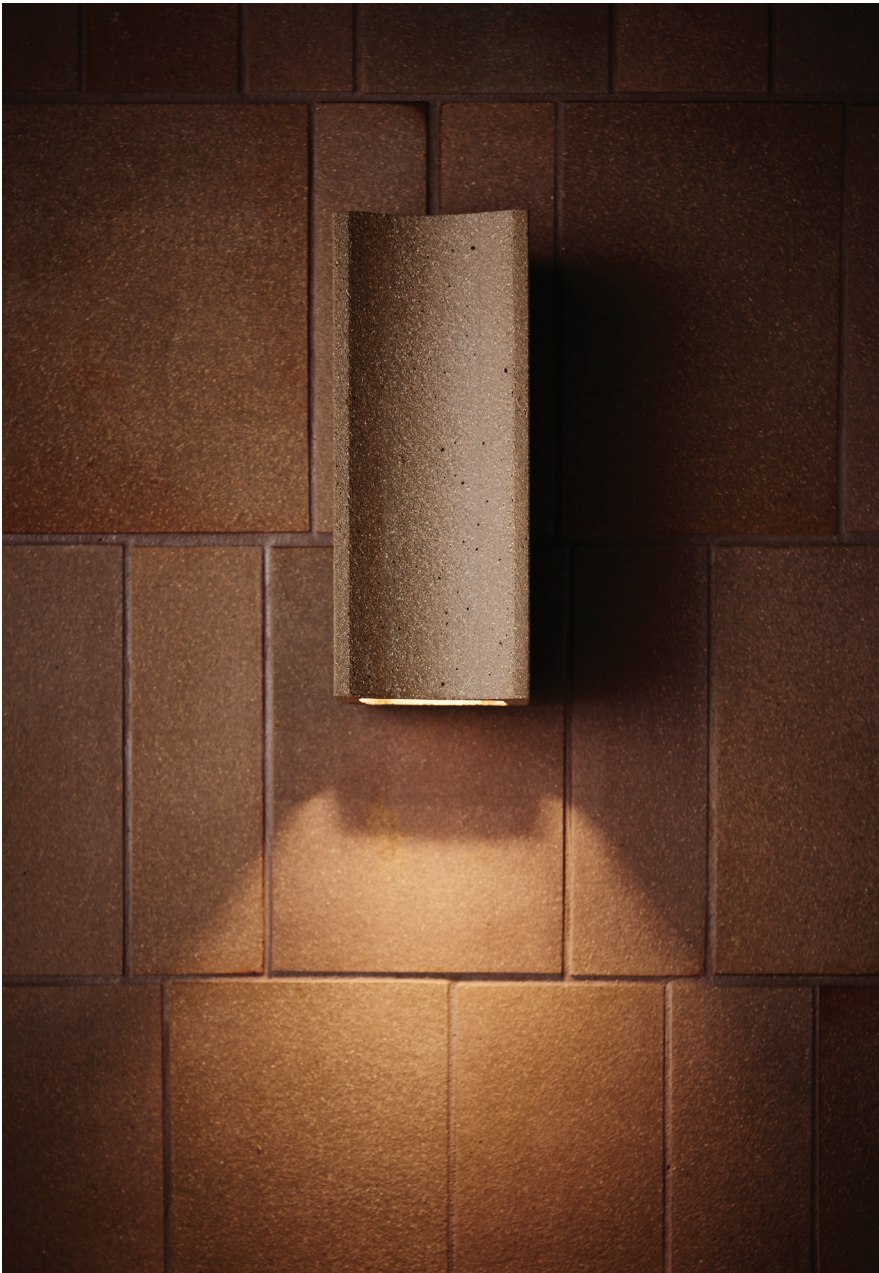
Flute – Natural