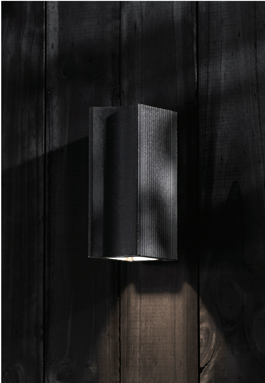
Flute – Charcoal