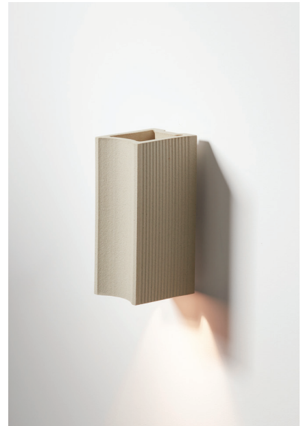
Flute – Off white