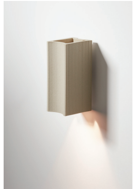
Flute – Off white